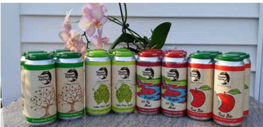
Four of the five of Tapped Apple's Ciders are available in cans at local package stores.

We are currently open on Friday, Saturday and Sunday for tastings! Due to COVID-19 regulations, our seating capacity is reduced so we highly recommend making a reservation at tappedapple.com . We still are offering our tasting room for private events: birthday parties, bridal showers, baby showers, etc. Call (401) 637-4946 for details.